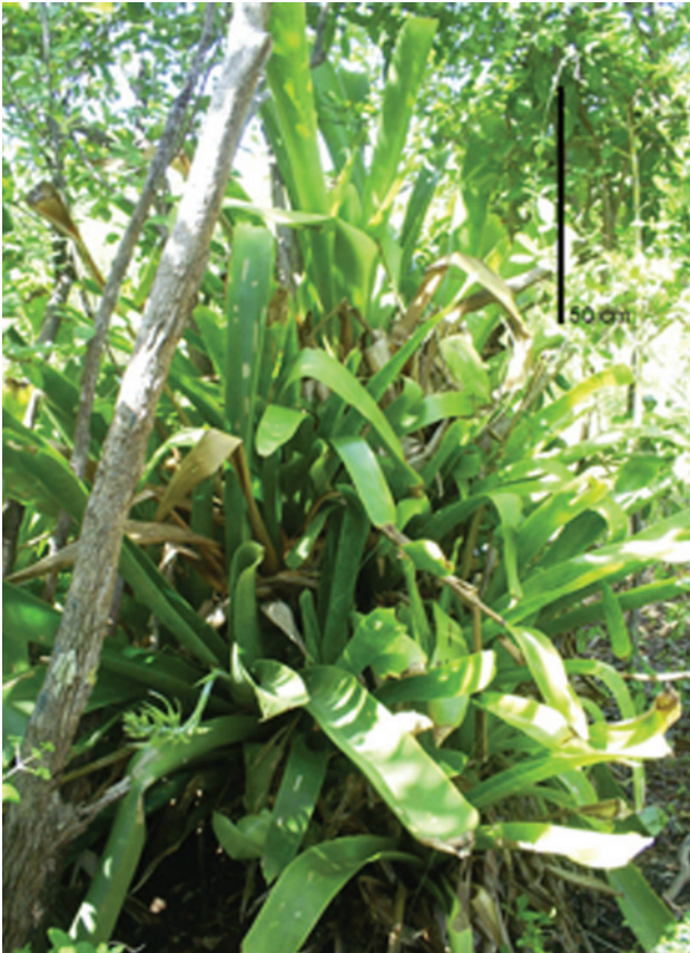
Figure 1. Hohenbergia mesoamericana I. Ramírez, Carnevali et Cetzal, in habitat.

long, 0.5 mm wide, mucronate, versatile, white, pollen yellow; ovary 7.5 mm long, 5.8 mm wide, inferior, ovoid, green, slightly white-lepidote at base, ovules obtuse, stigma longer than stamens in anthesis, green, with 3 stigmatic conduplicate (but not spiraled) twisted lobes. Fruit 4-4.2 mm long, 2-2.3 mm diameter, ovoid, immature seeds, 0.2-0.3 mm long, ovoid, orange.