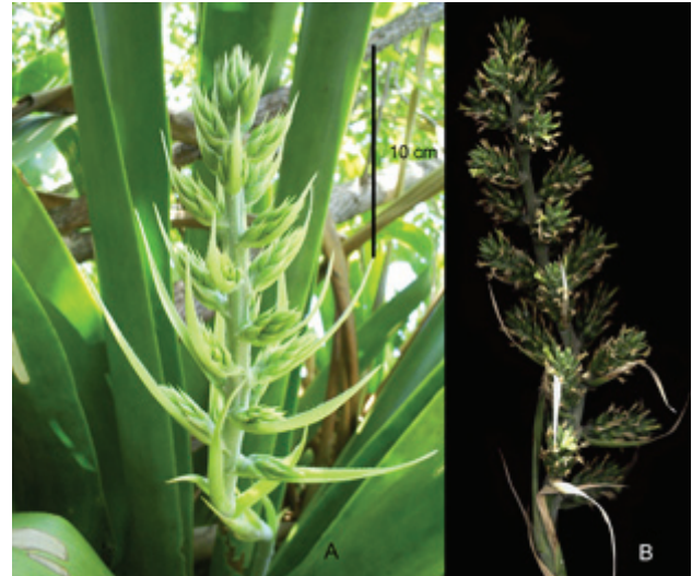
Figure 2. Hohenbergia mesoamericana I. Ramírez, Carnevali et Cetzal. A, immature inflorescence; B, mature inflorescence.

Hohenbergia mesoamericana is only known as an epiphyte growing on the low portion of tree trunks, very close to the forest floor, with the roots surrounded by dry leaves, in low deciduous forests dominated by Erythroxylum confusum Britton (Erythroxylaceae), at sea level. This type of vegetation is typically found over limestone outcrops. This highly endangered type of vegetation is the home of many of the regional Yucatán Peninsula endemics (Durán et al., 1998, Carnevali et al., 2003), including this novelty.